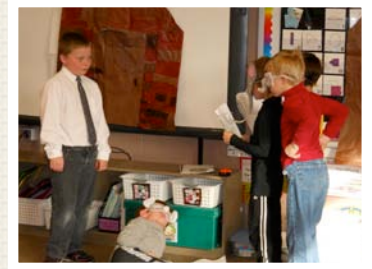
Three Little Elephants