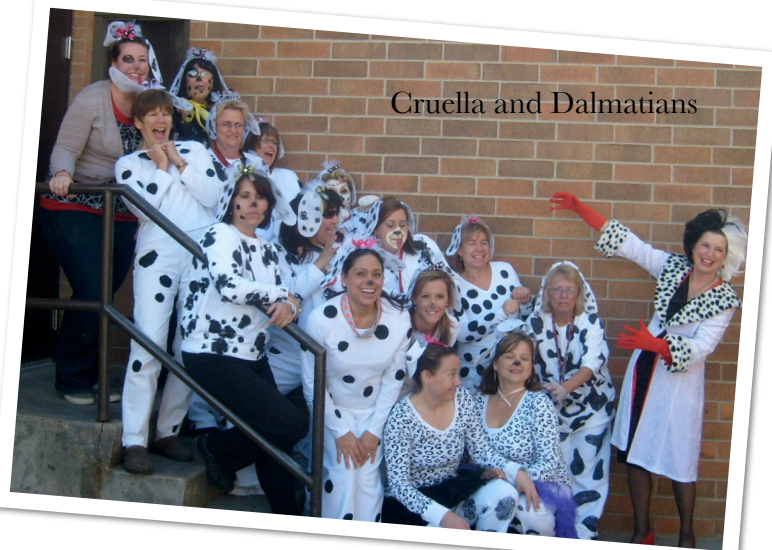
Cruella and Dalmatians